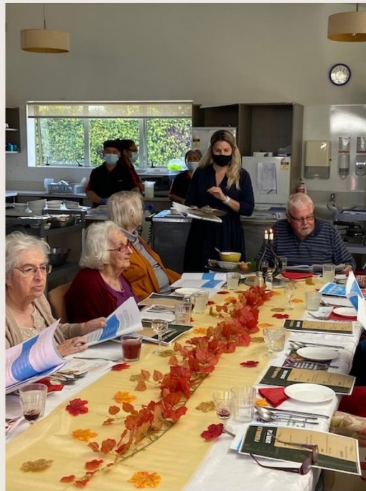
Residents enjoying their Passover meal

All the residents enjoyed this yearly ritual and fun was had by all.