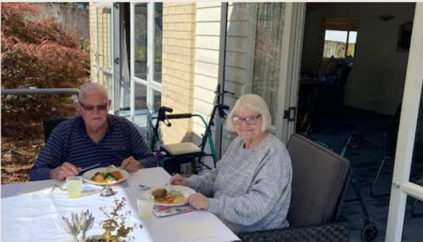
Enjoying some lunch on the Terrace