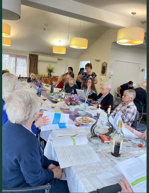
Marking an important Jewish holiday