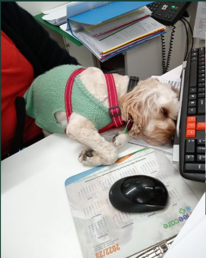
Marlene's dog tired after a busy day at work