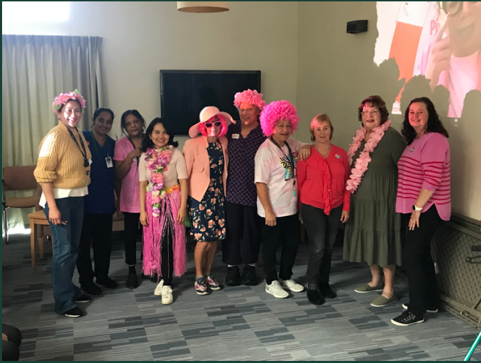
Pink Ribbon Breakfast