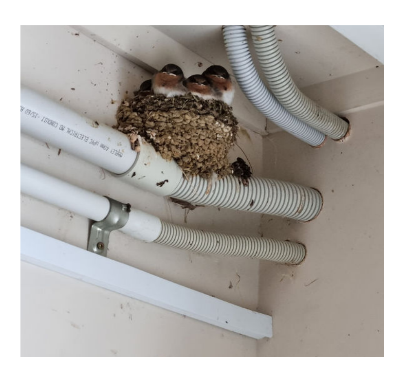
Some wee birds make their annual return to the garage