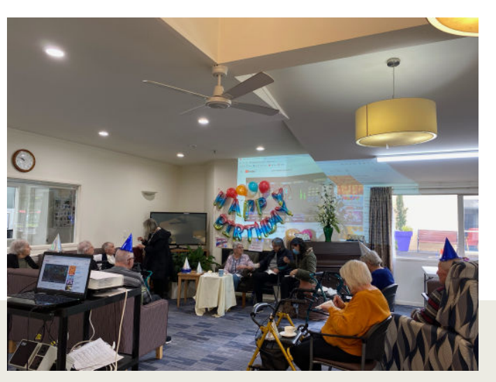
Happy Birthday CHARLOTTE