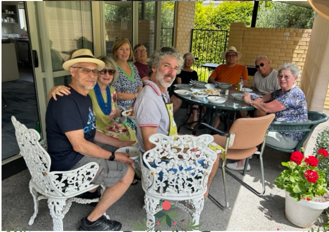
(Left) Wonderful helpers who made the Christmas celebration possible